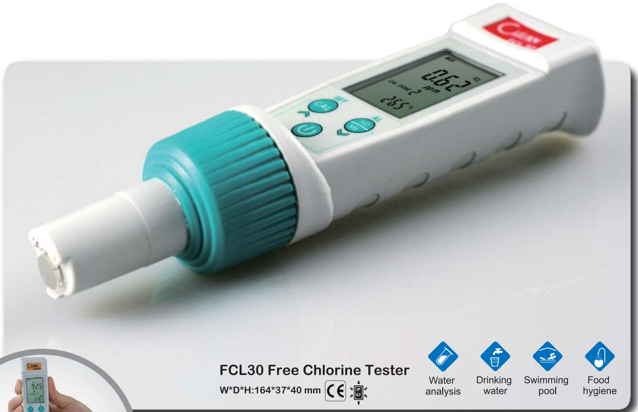
FCL30 Free Chlorine Tester